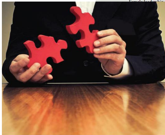
ADVANCING WOMEN LEADERS: The Connection Between Women Board Directors and Women Corporate Officers